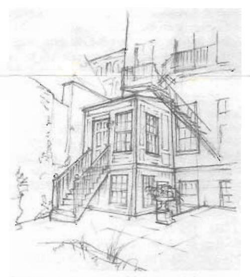
Our next project is the much-needed restaration of the rear extension, which was an enclosed porch in the 19th century where the family took tea. The work will include reproducing the original stairway down to the garden.

In January, we completed repairs to the exterior east wall and finally, with the walls now watertight—and dry—it became possible to undertake interior plaster and paint