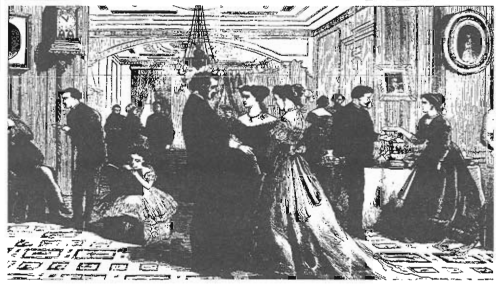
New Year's Day Reception in New York City — Harper's Weekly, January 4, 1858