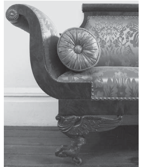
By the 1850s, the Federal sofa, with its elaborate hand carving and eagle feet, was definitely old fashioned, demoted from pride of place in the front parlor to the family dining room in the basement.

Recommendations for changes will cover wall finishes, floor coverings, window treatments, and lighting. For example, we will repaint all exhibition rooms, hallways, and stair areas in accordance with findings of the 2004 Paint and Finishes Analysis (which revealed the rooms were never painted white, as they are today). We will also replace the badly worn stair carpets that were installed in 1980 with a period-appropriate option.