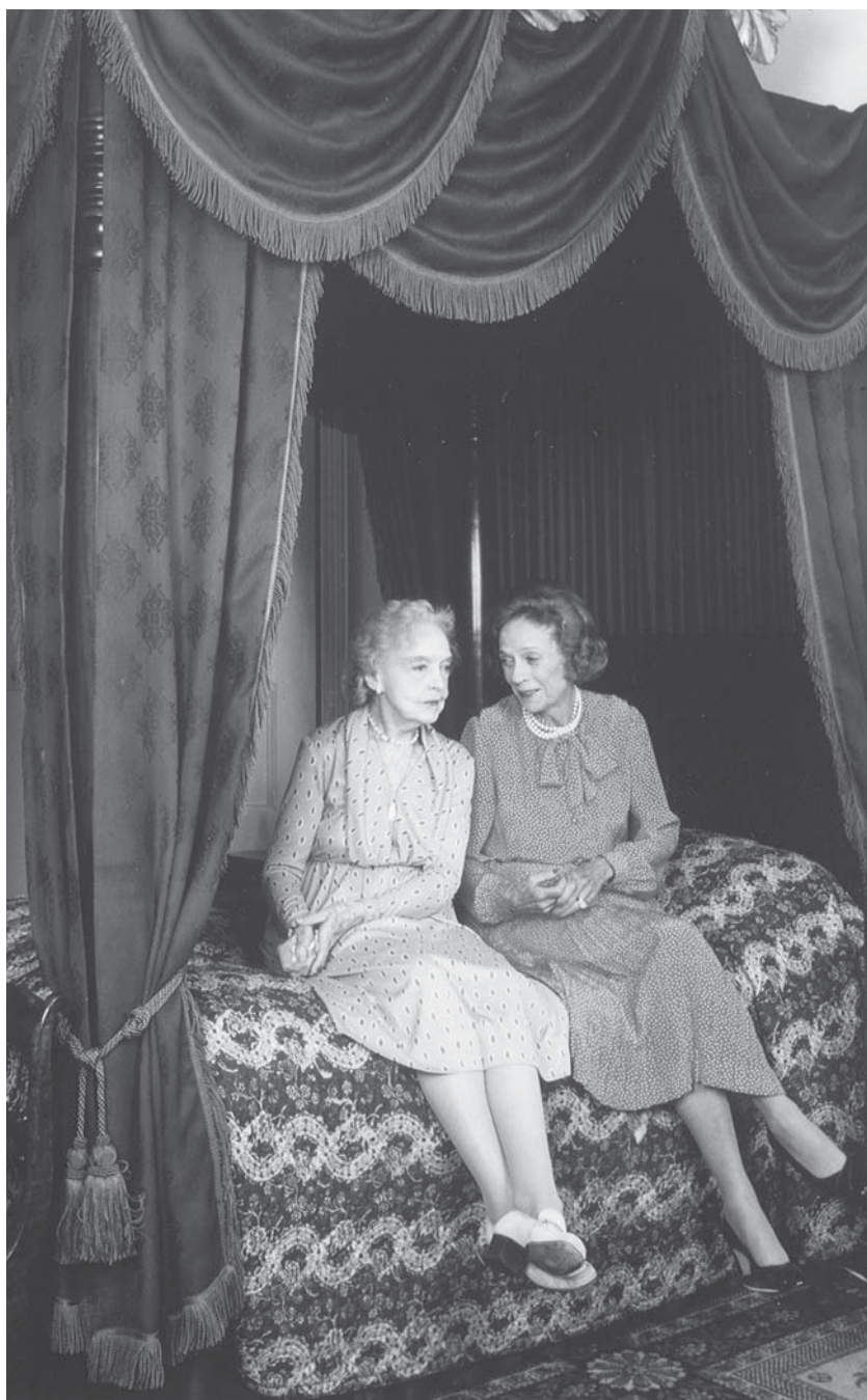
Brooke Astor, right, chats with her long-time friend, the actress Lillian Gish, at the 1981 holiday party, where Ms. Gish entertained guests with a reading of Charles Dickens's "A Christmas Carol."

That is what we are all about, and we will always be grateful to Brooke Astor for helping us to fulfill our mission and proud that she had confidence in our stewardship of this unique historic treasure.