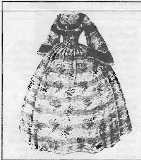
Two-piece day dress of silk taffeta from the Tredwell group of dresses in the Merchant's House Museum costume collection. The dress dates from 1858-61. The drawing was sketched in 1935 for the Index of American Design, a federal arts project.